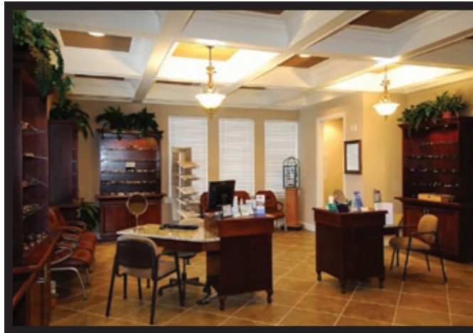
Expanded optical showroom within the practice's new 2,000+ sq. ft. facility unveiled to patients in Dec '08, located in the heart of Trinity.