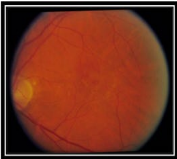
Image of Healthy Retina